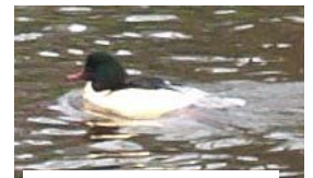
Male goosander near Oldgate Bridge