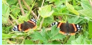
Red Admirals at Heddon Common

Are you the next David Bailey? Are your considerable photographic skills going unnoticed? Here is your chance to shine! The Friends of Carlisle Park will be running their own photograph competition from 1st April 2006 until 31st March 2007. As long as your