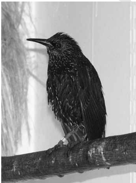
Figure 45.3 A laboratory starling with hyperkeratosis. Note the poor feather condition and specifically the heavy, overgrown bill and thickened scaly legs.

Parasites and infectious diseases are not thought to be a major cause of mortality in free-living starling populations