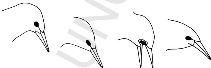
Figure 45.1 Distinctive probing behaviour of a starling, from Feare (1984). From left to right the bird searches for indication of a prey item; lowers its head pushing its closed bill into the soil; it opens its bill to create a hole whilst rotating its eyes forwards; then raises its head to complete the movement. Reproduced from The Starling by Feare, Christopher (1984), by permission of Oxford University Press.