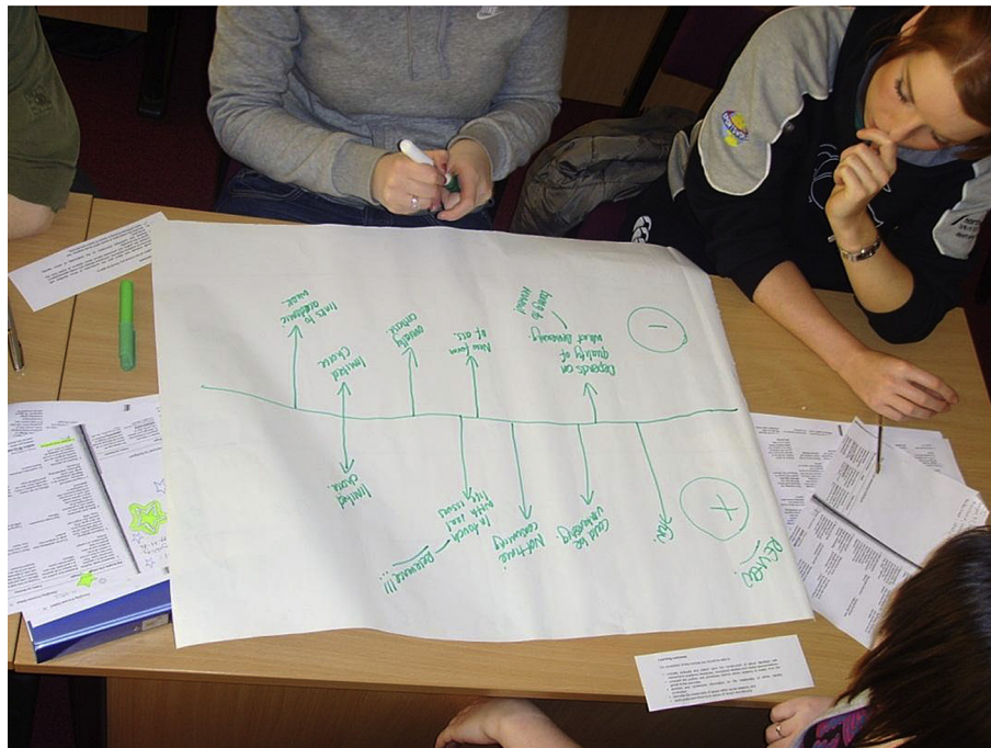
Fig. 3. Forcefield analysis of positives and negatives, regarding different assignment types.

While the depth of our focus on these two contexts in advance and in the field is an important pedagogic dimension of the module, it also encourages students to consider these issues of nationhood, race and ethnicity in Britain and in their own lives and experiences in ways which are sometimes quite difficult to do sensitively when engaged with more directly. In this respect at least, it is the oblique rather than direct approach of a module that is ostensibly about other places, that make class discussions about the politics of national identity in London or Britain possible. In other instances students encourage each other to be more reflective about their own senses of national identity as they begin to explore the making of national and ethnic identities in Ireland and Northern Ireland. Despite the geographical proximity, many and often most students have never been to Ireland or to Northern Ireland. Others have family connections. Our discussions of these patterns of family links or previous lack of knowledge, and students' reflections in the field on what is similar and what seems different in both cities, feed into our consideration of the wider interconnected history of the making of ideas of Irish, British and English identity and difference.