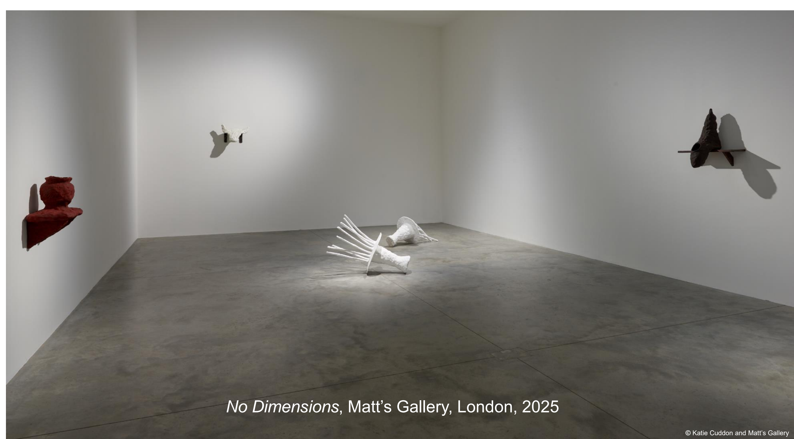
No Dimensions , Matt's Gallery, London, 2025