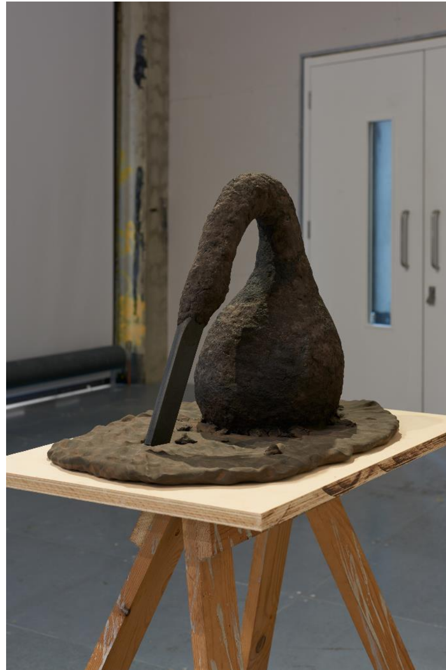
No Dimensions , 2022 Ceramic, paint, paper pulp, found object 39 x 53 x 37 cm