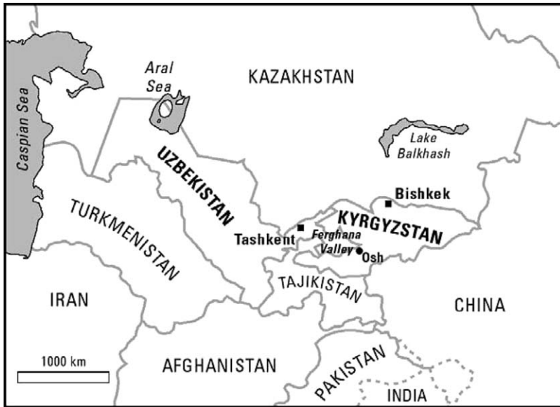
Fig. 1. Central Asia, highlighting the Ferghana Valley.

fences were unilaterally erected in disputed territory, bridges destroyed, cross-border bus routes terminated, customs inspections stepped up, non-citizens attempting to cross denied access or seriously impeded, and unmarked minefields laid. Tensions flared into violence at checkpoints, and people and livestock were killed by mines and bullets. Close-knit communities that happened to straddle the boundary were spliced in two, and a concomitant squeeze on trade added to the poverty and hardship of the Valley's folk. These experiences of 'the border question' traumatized border region populations and marked the most significant deterioration of relations between the two states since independence from the USSR in 1991.