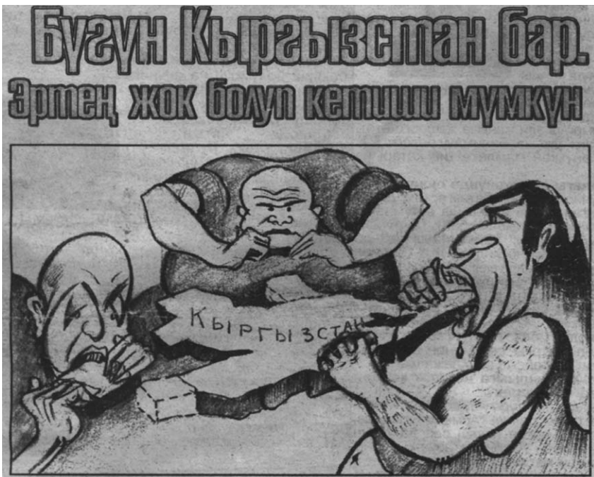
Fig. 2. “Kyrgyzstan—here today, gone tomorrow?” (“Bügün Kırğızstan Bar: Erteng jok bolup ketishi мүмкүн?”, Aalam 7 (259), 34/02/1999–02/03/1999).

In the old days a khan would give this counsel to his son: ‘If, during your reign, you add one inch of land to your country you are a great khan. If you