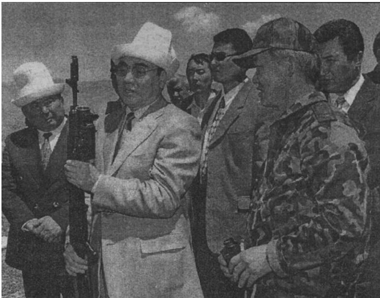
Fig. 3. President Akaev inspects the southern border forces. ‘Our border is secure. Our people can go about their work in peace’ (‘Chek arabiz bekem. Elibiz tinch emgektene berse bolot’, Erkin Too 27 (941), 29/03/2000).

In looking at the border and state security, it cannot be denied that the policies and efforts of president Askar Akaev in the last 10 years have